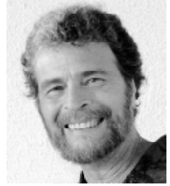
Robert Venosa roberto@venosa.com

"However, whatever recognition I have received from the public comes primarily from my association with LSD. But I have also discovered the compounds Ergometrine and Metrogine, both of which prevent post-partum hemorrhage, saving a number of lives of woman during childbirth. Hydergine, which stimulates oxygen flow to the brain, relieving symptoms of deteriorating mental capacity, is also another discovery of mine. And I consider these discoveries equally important as LSD-25. These are also kinder, but perhaps not as problematic." It should also be mentioned that Albert synthesized psilocybin, and when he presented the compound to Maria Sabina, she assured him that it had the exact same spirit as in nature's psilocybin. Albert said that he has always regretted that the potential of LSD as a psychotherapeutic aid and/or cure for various ailments and addictions was short-circuited in the 1960s by governmental interdiction and prohibition following LSD's rapid, widespread and uncontrollable dissemination. The horror! Reports of trippers jumping out of windows trying to fly; hair on men growing below their shoulders, the devil's lance of Hofmann and Leary impaling the souls of innocent children; and most threatening of all, a generation was discovering a spiritized individuality,