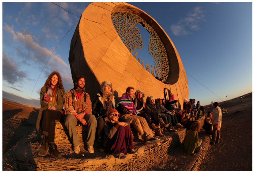
A group of AfrikaBurners watching the sunrise on the Sand Clan.