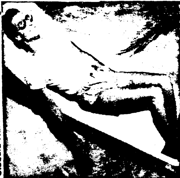
Ecstasy in 1984.

mescaline molecule, Shulgin was able to isolate the mimetic neurotransmitters that enhance colors, and one that enhances sound. The chemists took his research further, and isolated the neurotransmitters prompting empathy.