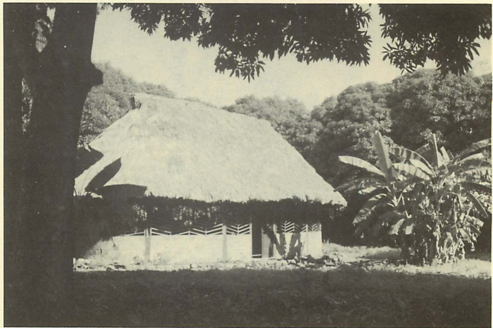
The Maloca, location of the therapy sessions

The originality of the Takiwasi treatment is also to associate the use of plants and shamanistic techniques with modern therapies or other introspection techniques such as Holotropic breathing after the Stan Grof model, Bach flower essences, massage, saunas with medicinal plants, group dynamics, artistic and bodily expression, meditation, breathing exercises and other purges taken during specific lunar phases.