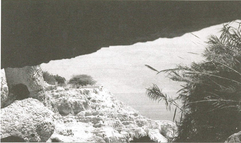
The Dead Sea Scrolls were found in caves much like this one in the cliffs overlooking En Gedi between Qumran and Masada on the western shores of the Dead Sea.