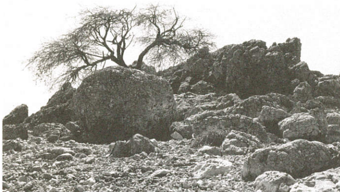
The landscape of the Dead Sea shoreline is an unforgiving place of heat and rocks, where only the heartiest survive.

expediting the pace and quality of research.