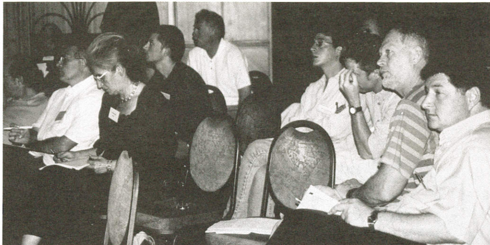
Conferees attended a rigorous series of informative presentations lasting well into late evening... This symposium enlarged the Israeli researchers' point of view toward MDMA and similar substances and served to reduce the stigma associated with them.

clinical research subjects based on data from rave-goers who take MDMA in high-ambient temperatures, exercise vigorously, and sometimes do not consume sufficient fluids. In contrast, clinical research contexts involve the administration of MDMA in temperature-controlled settings, to people who are resting in bed and are supplied with fluids. This data about the importance of ambient temperature requires a revision of the understanding of the mechanism of MDMA-related neurotoxicity. Some drugs which we previously thought blocked neurotoxicity through a specific pharmacological mechanism turn out to actually block neurotoxicity through non-specific blocking of hyperthermia.