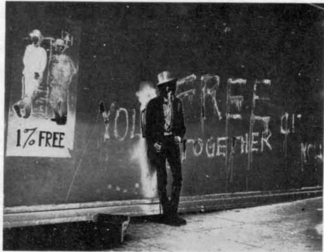
YOU - Free Together