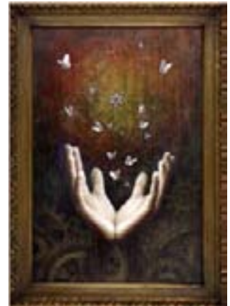
"Integration" by Autumn Skye, 2009