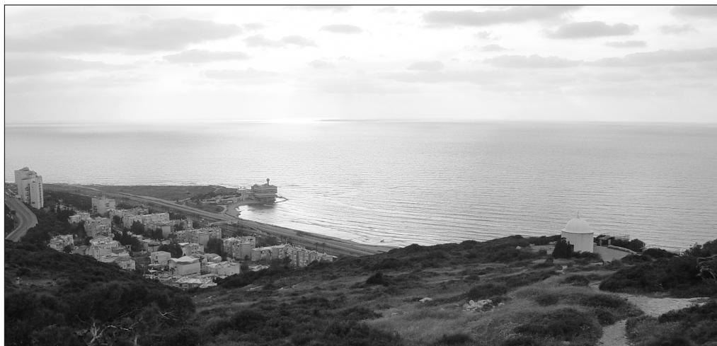
View of Haifa, overlooking the Cave of Elijah.

I would like to thank MAPS for giving me the opportunity to publish the appeal for funds, which brought us in contact with the right people. The trailer is online on the MAPS website at: http://www.maps.org/ibogaine and the entire DVD is for sale from MAPS for $20 plus $4 shipping. You can also visit the website of the film's production company [ www.lunartproductions.com ], where all the info on this project is online.