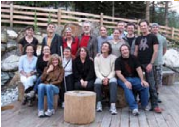
MAPS staff and researchers pose at our first MDMA therapist training retreat in Austria.